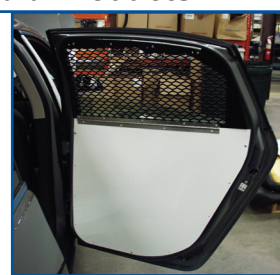
Window Guards & Door Panels offer maximum protection from damage. Easy to work with and transferable between like vehicles.